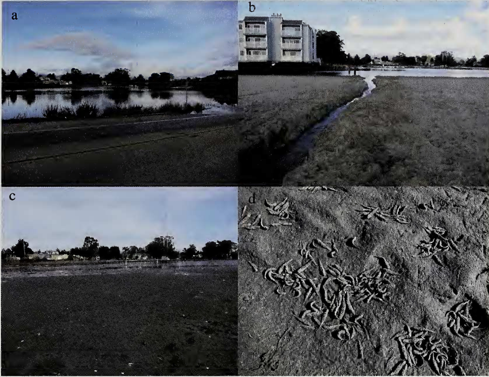
Fig. 4. a) Full Corcoran lagoon before breach, 19 December 2015; b) Trench dug on beach at seaward end of Corcoran lagoon, 19 December 2015; c) Drained Corcoran lagoon about the same area as shown when lagoon full in Fig. 4a, 11 February 2014; d) Moribund northern tidewater gobies on substrate of Corcoran Lagoon coated with sand from struggling on the surface after sudden lowering of the lagoon, 11 February 2014.

reduced to about 10% of its aerial extent. A residual ponded area just inside the gap in the beach was roughly circular, about 50 m in diameter, and had been 3-4 m deep judging by the empty lagoon border (Fig. 3a). The remaining drained area was exposed moist sand with seepage and two remnant pools on the south side. The large gap in the barrier sand berm remained by 16:00 with a strong outflowing current. Water temperatures ranged from 17-20°C, and salinities from 1.0-2.5‰ measured at three locations: at Harbor Boulevard, just inside the break in the beach berm, and to the north in the wastewater outflow. The narrow range of water quality measurements over widely spaced sites indicates the lagoon was well mixed and very similar in temperature and salinity in the areas less than 2 m deep. The deep pool near the ocean may have been more saline at depth. Some wave surge carried into the lower lagoon during the first half of the day within 150 m of the breach. The water throughout the lagoon was yellowish to greenish, visibility limited to about 40-50 cm. At Harbor Boulevard Bridge, the water coming down the river was clearer but roiled by fish activity. The lagoon had not appreciably refilled by approximately 16:30 when the survey ended.